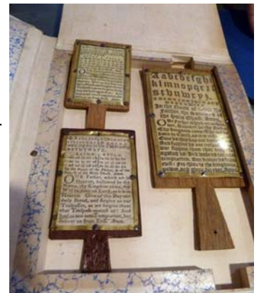
John Farmer - Docent

The horn tacked on over the lessons was used to keep the lessons from being soiled by the child. The horn of oxen and sheep were used to make the laminating structure. The horn was left in cold water for several weeks, which separated the usable part from the bone. It was then heated, first in boiling water then by fire, and pressed by plates and machines to make it smooth and transparent.