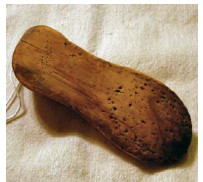
Larry D. Smith - Museum 665

The Shoe Last was a wooden form carved in the basic shape of a foot, over which pieces of leather would be shaped and attached together to create a shoe or boot. During the colonial period there was no distinction between left and right shoes, so a single last would be used for both. The shoemaker would maintain a number of lasts to cover various sizes. Notice the holes in the bottom of the last, which resulted from the shoemaker tacking the leather onto it.