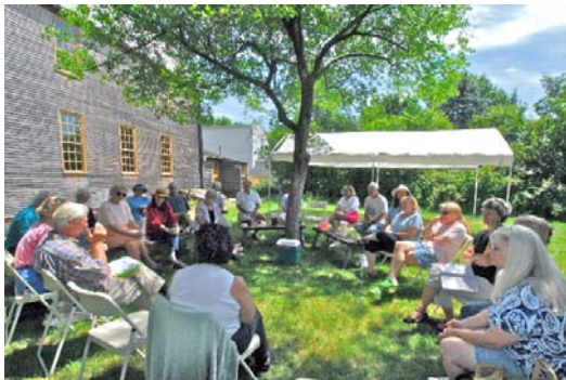
Below: Volunteers enjoy an informal gathering in the shade of the hawthorne tree.

Delene Perley recently lead a group of THM Volunteers through the Stroudwater burial ground in preparation for our cemetery tour to be held in October.