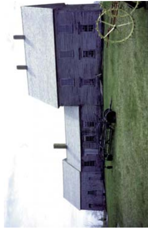
The Olson House is the subject of numerous works of art by Andrew Wyeth.

The Olson House is the scene of Christina's World , which was a favorite theme of Andrew Wyeth's work in the Maine area. All of our passengers will recognize the start Maine farmhouse that was a vital and integral subject in Wyeth's paintings.