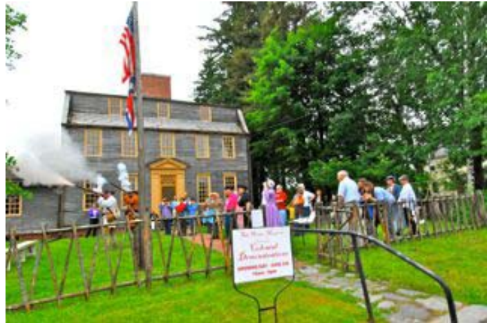
Above: Visitors gathered on the front lawn for the flag raising ceremony and musket firing to begin the festivities.